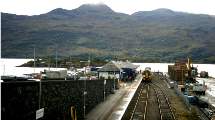
Kyle of Lochalsh, one of the places where he has been spotted.

*World exclusive* *Shocking revelation* *Read the full story inside as Postman walks 1000 miles in his spare time*