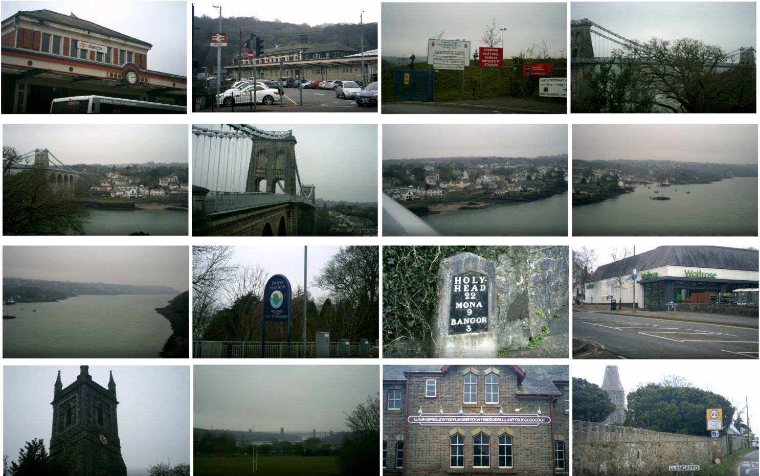
By Philip Catherall

This walk wasn't one of my better walks, but I always cherish the experience all the same. I wanted to walk from Bangor to Holyhead, and as you can see from one of the photos, I was only 22 miles away at Menai. Following the A4080 and the A5 I quickly found that the pavement stops just after Llanfair P.G. So I followed the official cycle path. The problem with this cycle path is that it mainly follows the more quieter roads rather than an actual path, although it does start that way. Another problem is that it takes you miles away from where you want to be heading and I quickly began to realise that I wasn't going to get to Holyhead at all if I followed this path much longer. So when I reached the village of Llangaffo, I decided to try to head back to Bangor. I didn't want to go back along the route I had just followed and tried to head back directly. This wasn't such a great idea because there are very few signposts and not being familiar with the towns and villages on Anglesey, apart from the ones along the railway route I quickly lost my bearings. Eventually I managed to reach Gaewen, which is a town and has a main road running through it. I managed to rejoin the A4080 and got back to Llanfair P.G. where things were familiar again. I began to realise that I didn't have enough time to get back to Bangor and so waited for the train at Llanfair P.G.