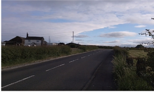
North Road, Atherton.

Atherton to Blackpool via Westhoughton, Adlington, Chorley, Bamber Bridge, Preston, Freckleton, Warton and Lytham St. Annes.