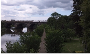
River Ribble, Preston.