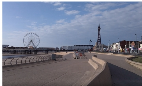
Central Pier, Blackpool Promenade.