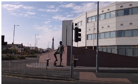
Jimmy Armfield, Blackpool F.C.