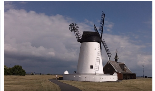
Windmill, Lytham St. Annes.