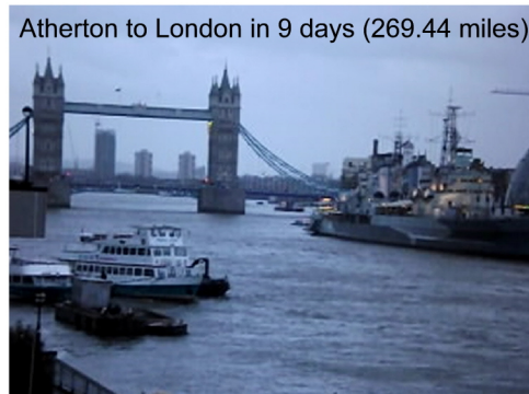
Atherton to London in 9 days (269.44 miles)

Between Monday 25th February and Friday 9th March 2019, I embarked on my most adventurous walk. From Atherton to London via Northwich, Stoke-on-Trent, Rugeley, Birmingham, Coventry, Rugby, Northampton, Milton Keynes and Watford. While I was walking through Coventry, I decided to visit the ruins of the old cathedral that had been destroyed during the Blitz. As I stood in front of the Altar and saw the words "Father Forgive", I knew that this walk was worth it, just to see that. I went through a lot of pain on that walk. But the pain of the residents of Coventry during the blitz and the pain that we all go through in our lives, and most importantly, the pain that Jesus went through. To see those words "Father Forgive", echoing what Jesus said on the cross. God helped me through that walk and is helping me and you through the walk of life.