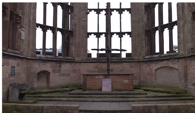
Altar: Coventry Cathedral

The scars are still visible as a constant reminder to the people of Coventry, but it is also a symbol of hope.